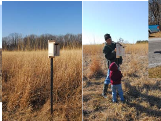
Dan Moorehouse with son Zed placing a bluebird box at Stony Hills.