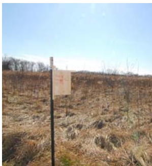
One of nine bluebird boxes placed at Stony Hills.

Over the years, bluebird numbers have declined due to habitat loss and development. Blue-