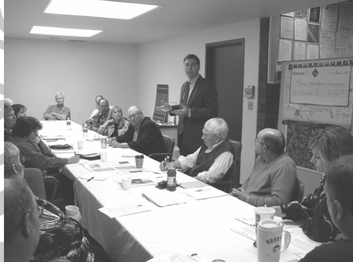
Senator John Sullivan addresses the council regarding State issues.

New projects were discussed and included the Brownfield's Hazardous Substance proposal, Brownfield's Mined Scarred Proposal. A re-