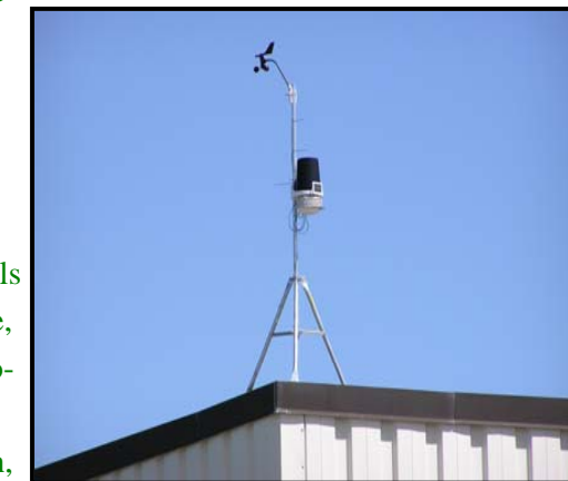
Weather Station at Macomb High School.