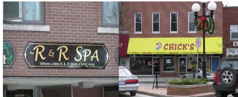
Two more minority owned businesses financed by Prairie Hills Small Business Loan Program.

Four new businesses created this year include: Midwest Bridge and Crane, Good Hope; Grisham's Diner, LaHarpe; All Pets Veterinary Clinic, Macomb; and TRAC Equipment, Canton.