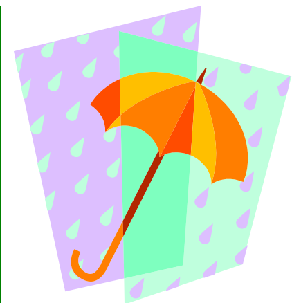
Have a safe and Happy Spring!