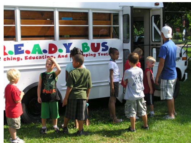
Children waiting to step onto the READY Bus to get their free book