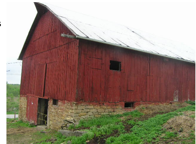
Historic barn located on the donated property.

The PLC has many plans in the making for this property, which includes kiosks, walking trails, and a parking lot to provide the public an en-